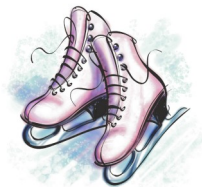
Figure Skating, Ice Skating and Ice Hockey

300 West Lincoln Ave. Anaheim, CA 92805 714-535-7465